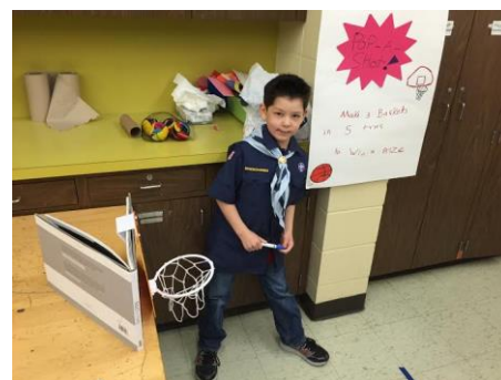
At the Carnival Den 8 put on for the Tigers