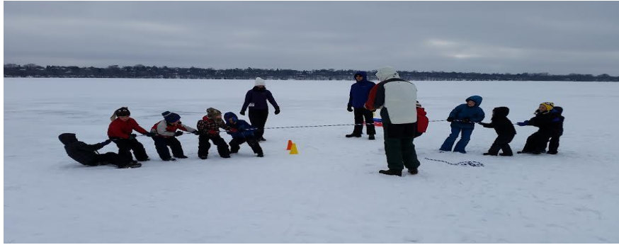
Cubs On The Ice