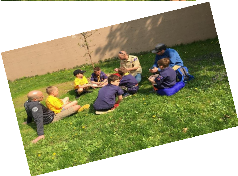
Camp Preparedness Activities – May 2016