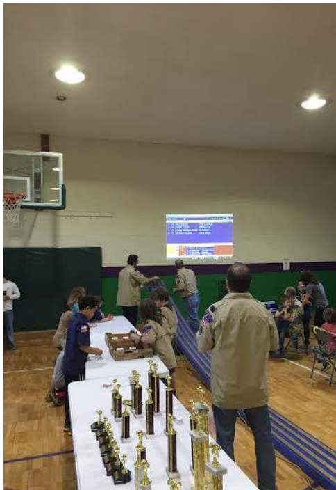
Pine Wood Derby – 2016